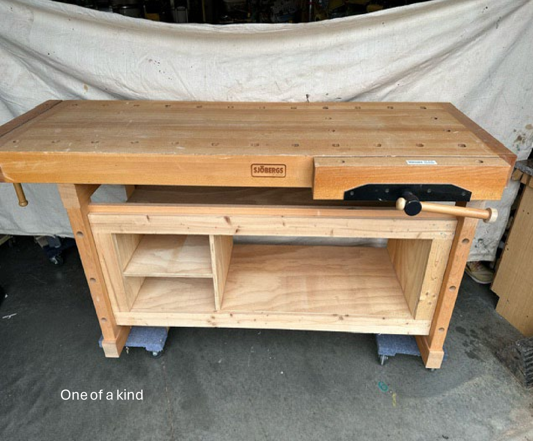
One of a kind