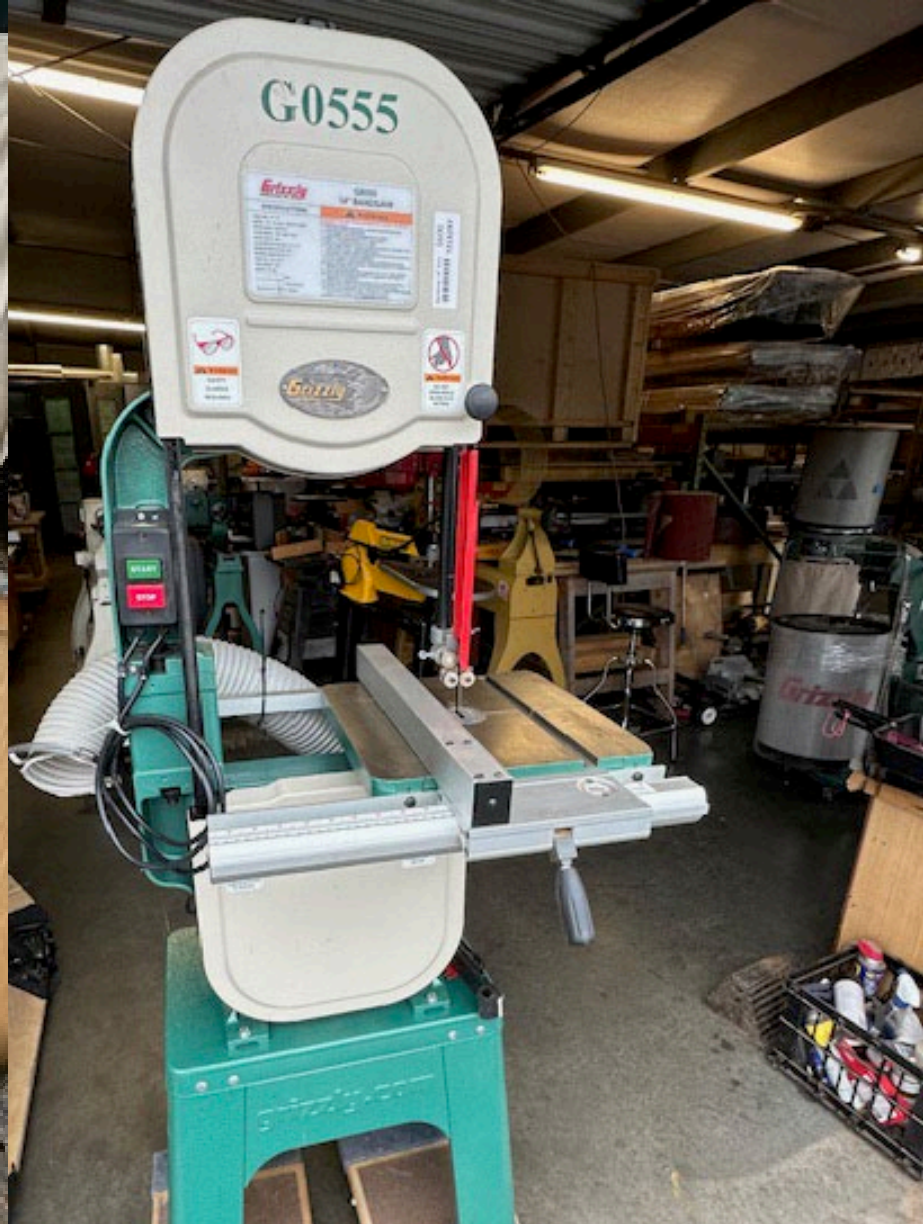
Band Saws – one of many