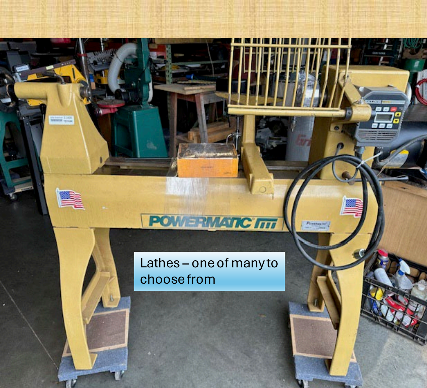
Lathes – one of many to choose from