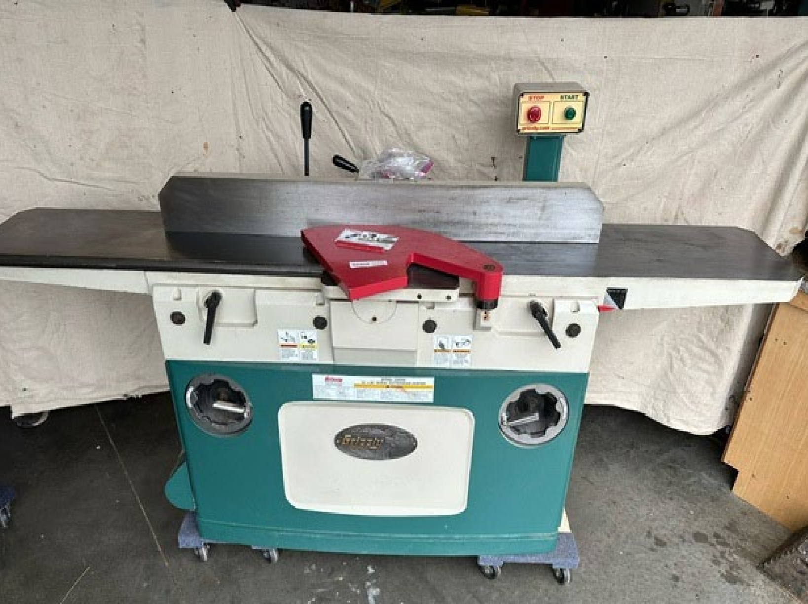
Jointers, we have large, medium and small