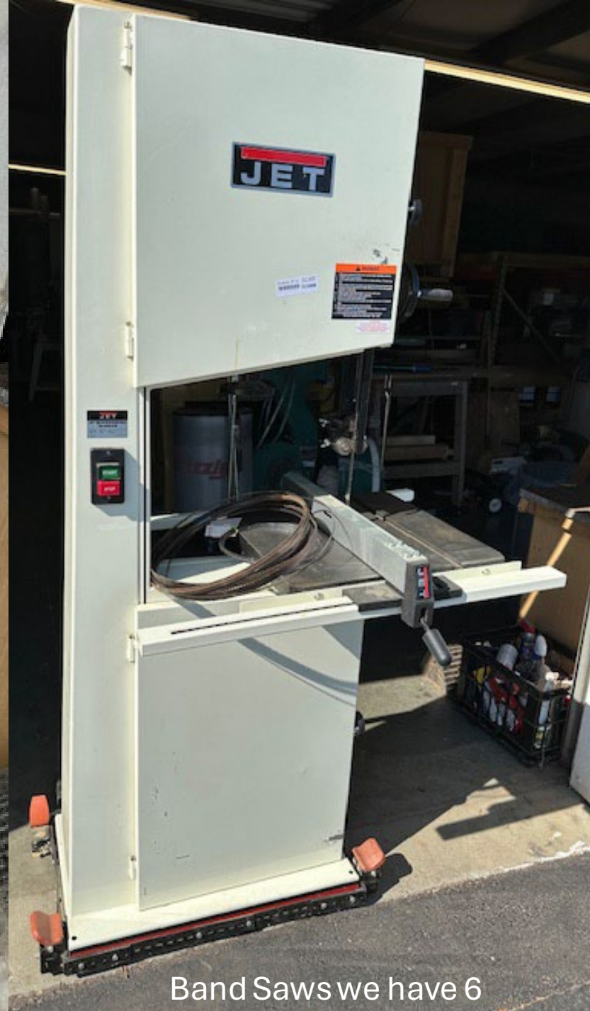
Band Saws we have 6