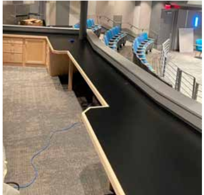
Children's Theater Sound Booth