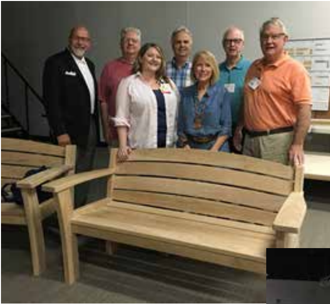
Cancer Survivor's Park Bench