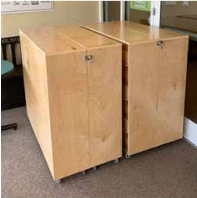
Child's Haven Rolling Bookcases