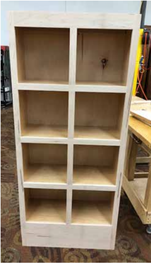
Jasmine House Cabinet