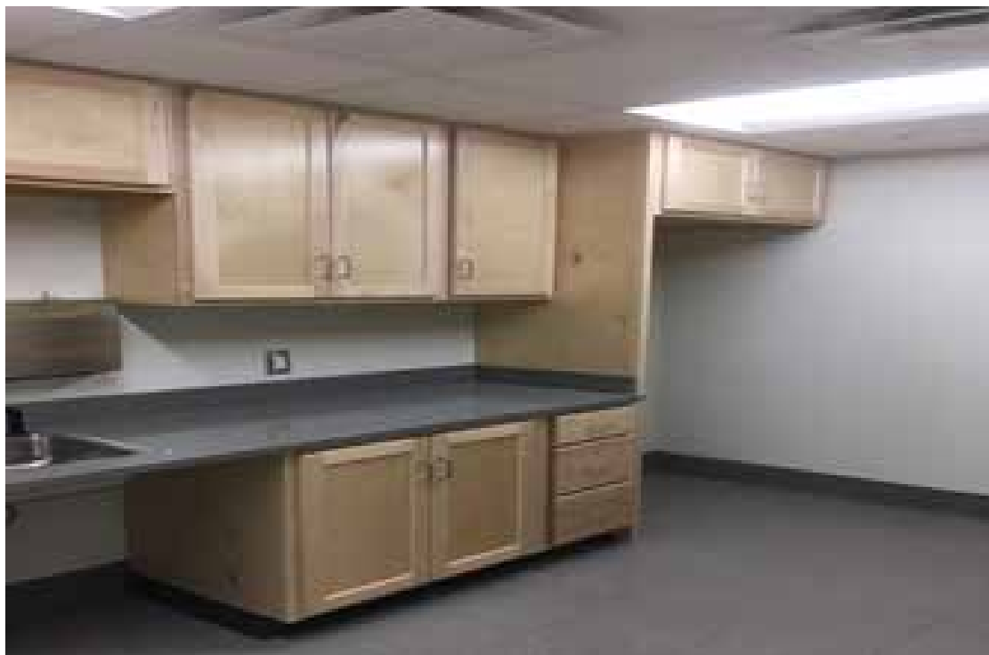
Children's Theater Cabinets