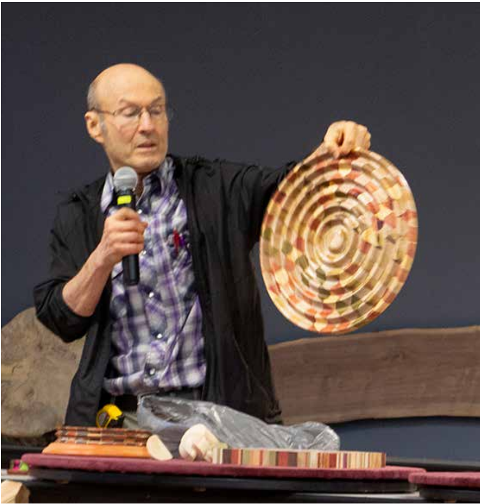
Turned platter from SpectraPly turning blanks by Dan Pollock