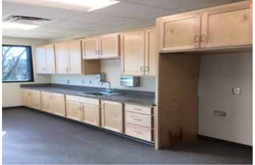
Children's Theater Cabinets