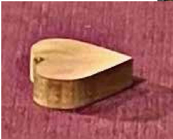
Heart Shaped Ring Box