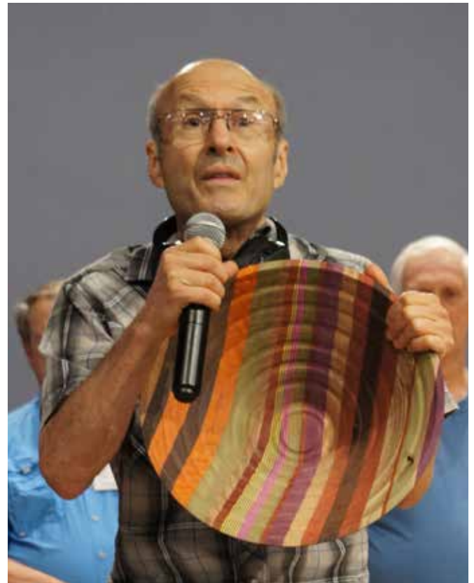
Turned Bowl from SpectraPly by Dan Pollock