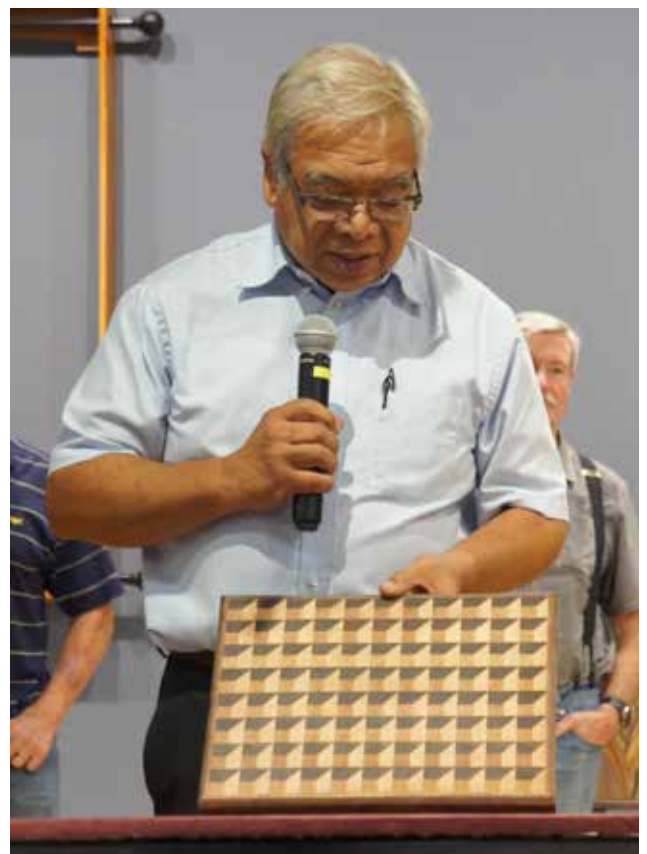
3-D Edge Grain Cutting Board by Ariel Jacala