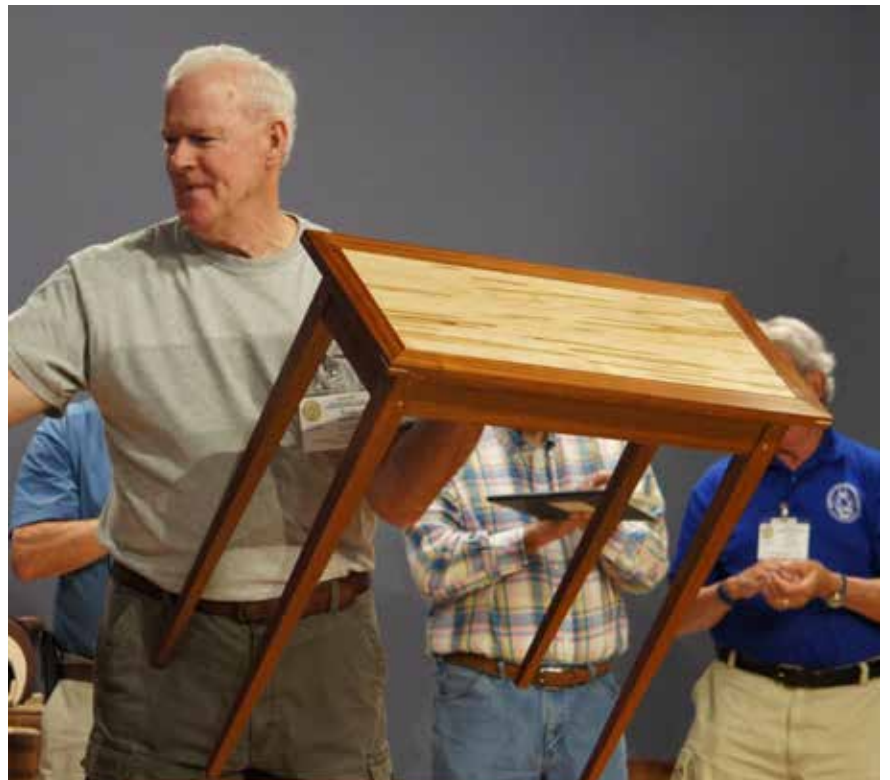
Side Table by Buzz Sprinkle