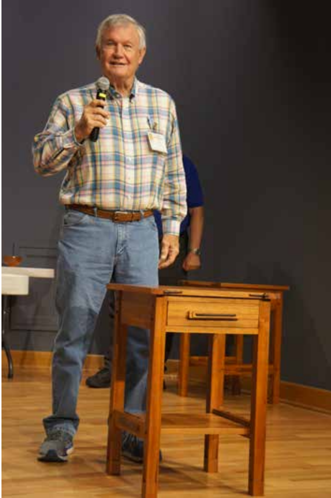
Side Tables by Bill Schmidt