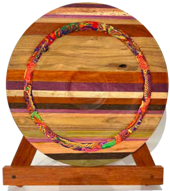
Dan Pollock – Platter