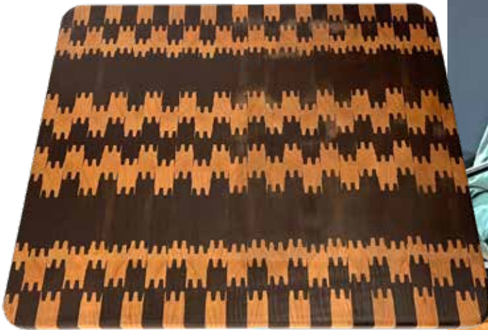
Simon Lock – Board Peruvian Walnut, Cherry