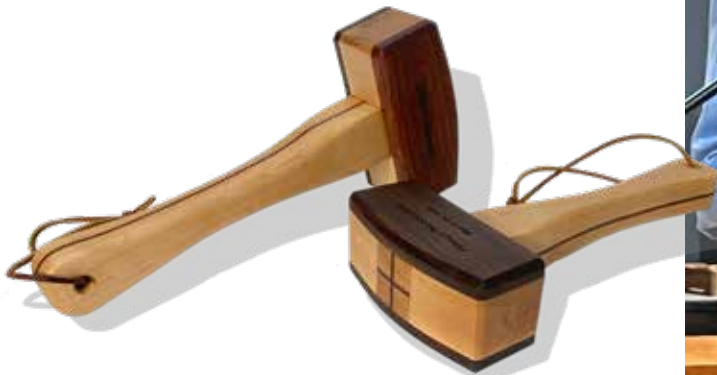
Mike Smale – Mallets Hard Maple, Sapele, Black Walnut