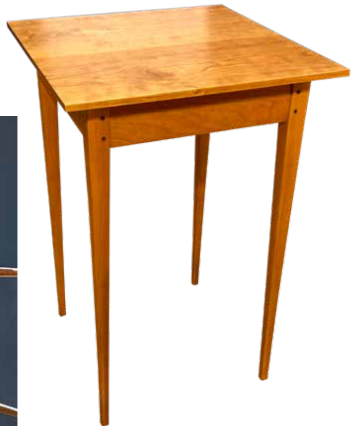
Dwight Blake – Table Cherry