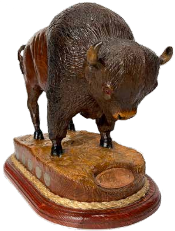
Ken Fissel Carved Buffalo Given to Him as a Gift