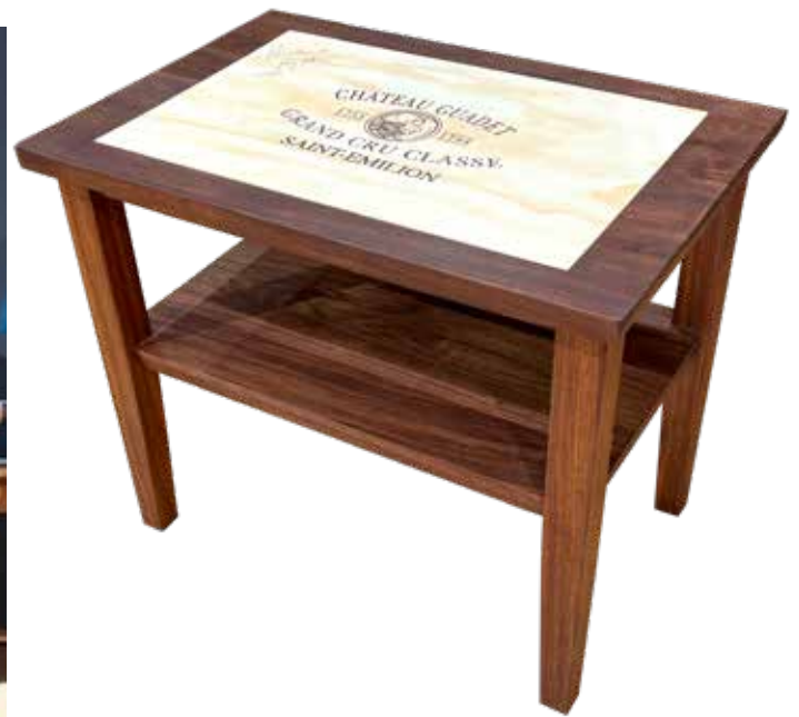
Karen Sheldon – Side Table w/Wine Box Top Inlay Walnut