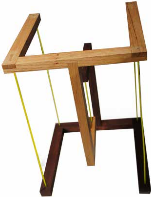
Tensegrity Table by Charlie Logue