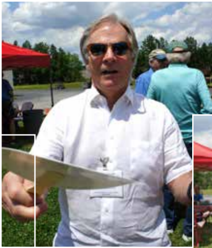
Getting together with friends. That's the ticket!