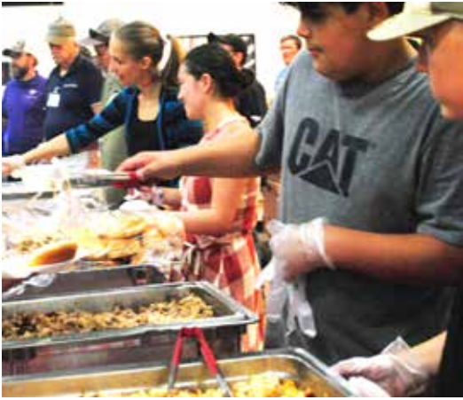
Low calorie BBQ and fixings. YUM!