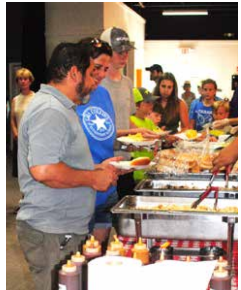
First in line every time