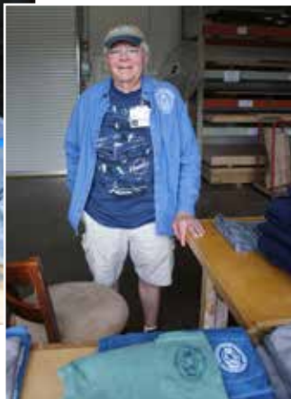
The Guild T-Shirt Concession was well staffed.