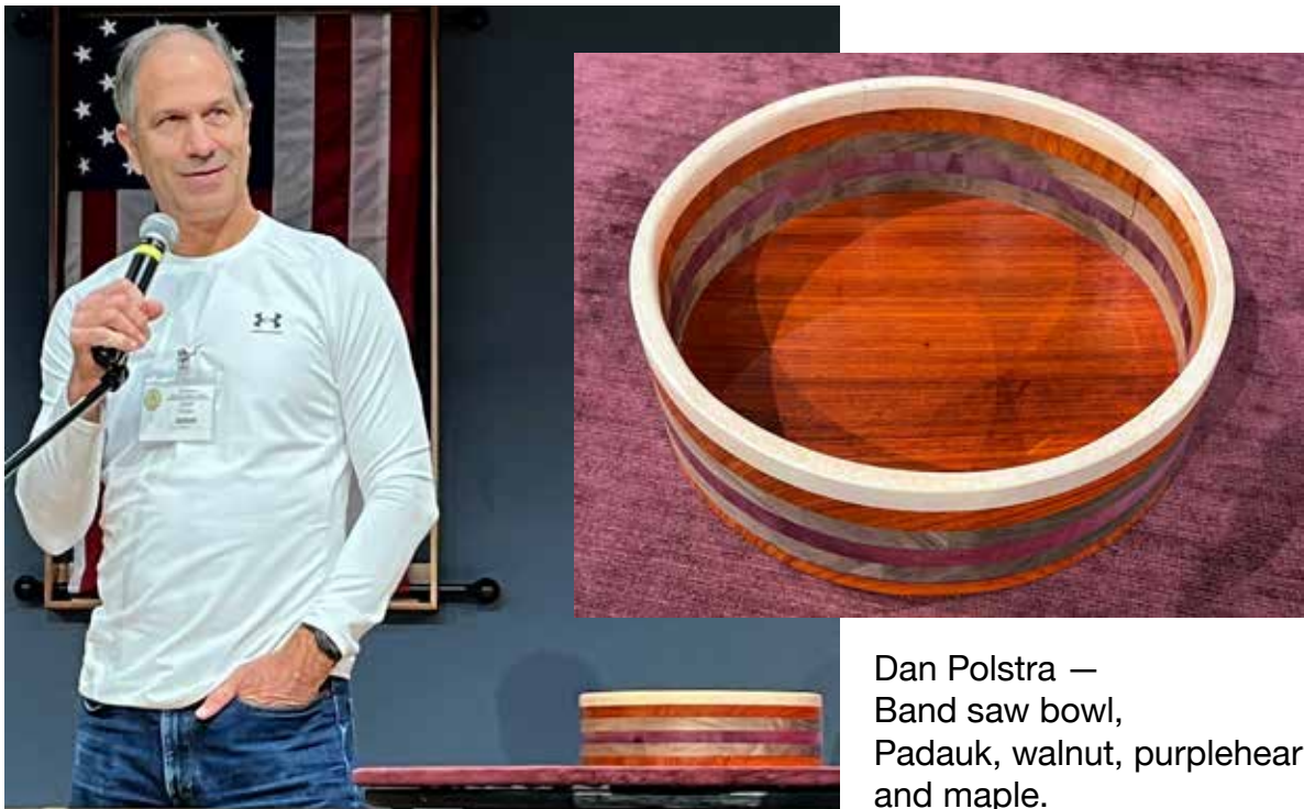
Dan Polstra — Band saw bowl, Padauk, walnut, purpleheart and maple.