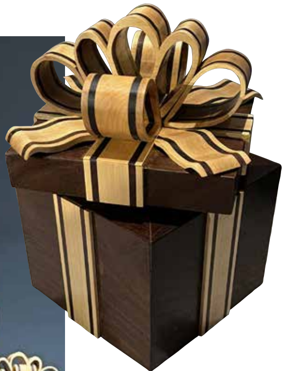
Roland Baird — Gift Box Peruvian walnut and maple