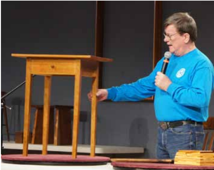
Side Table, Box, and Cutting Board by Bill Haley