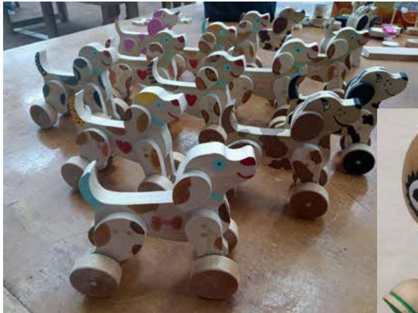
2023 Toy Program