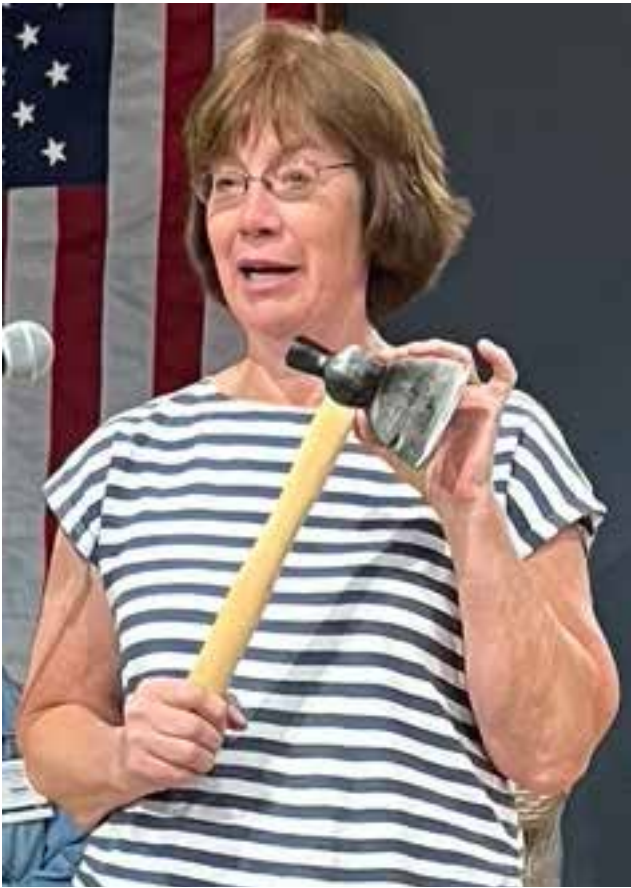
Hatchet - Ash with Walnut Wedge by Karen Sheldon