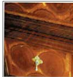
Quartersawn molding complements the grain of the oysters.