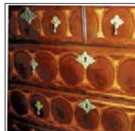
Reproduction pulls and escutcheons complete the outstanding details.